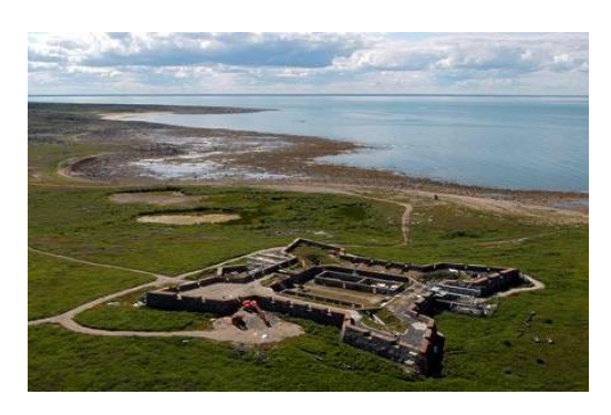
Day 02 - Beluga Whale and Prince of Wales Fort Tour & Kayaking with Belugas

This tour is a favourite for many as you get an hour of interacting with our beautiful beluga whales and also see an important part of Canada's history at the Prince of Wales Fort.